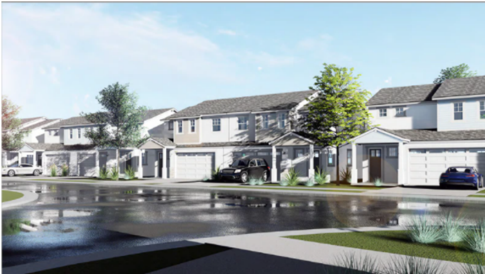
All of the townhouse buildings are composed of two or three attached units, each with a garage and driveway. (Handout)

By LAURA KINSLER GROWTHSPOTTER | SEP 09, 2021 AT 5:02 PM