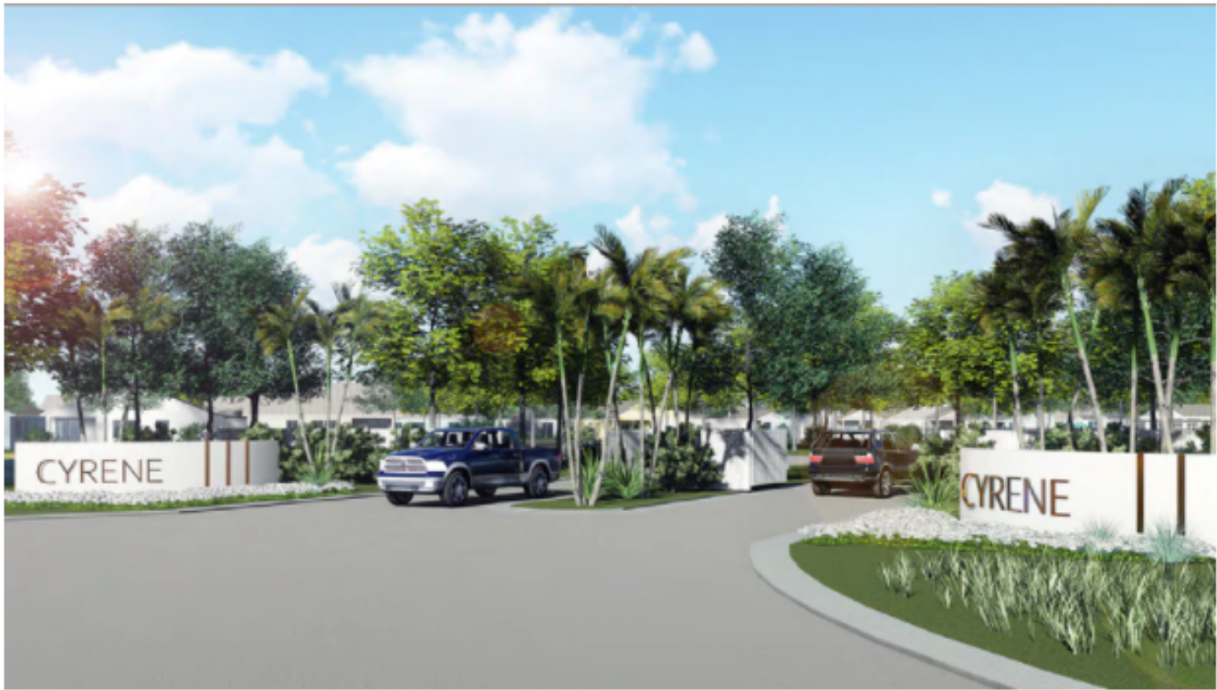
The gated community will have 140 units, a neighborhood pool, a tot lot and dog park.